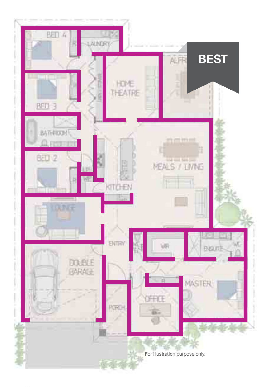
Pink® Soundbreak™ installed around the external walls, internal walls, noisy rooms and in between floors.

If creating the ultimate well insulated and quiet environment is the priority, this is the insulation package we recommend. Specifying Pink® Soundbreak™ right throughout the job - around all external walls + around noisy rooms and all internal walls + in between floors of a 2-storey home. Now you can look forward to all the peace and quiet in the world... cooler in summer and warmer in winter.